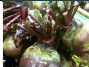
Limp Stalks (dehydration)